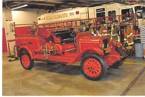
1928 Restored Fairfield Fire Engine