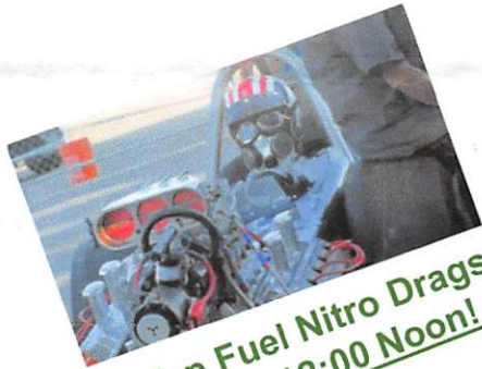
1966 Top Fuel Nitro Dragster Fired at 12:00 Noon!